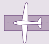
[Monument for the Korean Air Force]